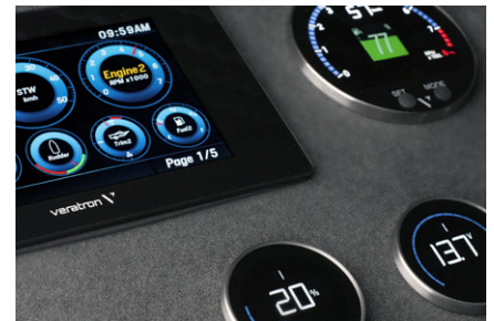
The VMH series look and feel gives an elegant and stylish touch to your dashboard