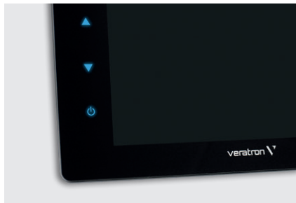
Lateral touch buttons are RGB illuminated and allow for a quick brightness adjustment