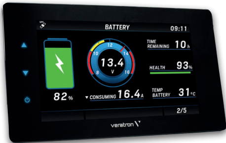
Intelligent Battery Sensor (IBS) screen to keep your energy supplies under control

The embedded NMEA 2000® gateway brings all the sensor readings and alarms to your external multifunctional display, saving the cost of an additional converter.